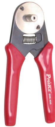
4 Way to Crimping