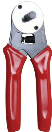
4 Way to Crimping