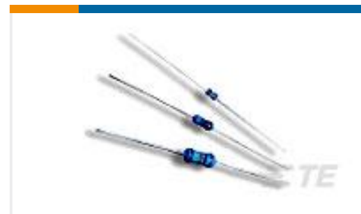
TE Part #1622744-1 LR2 1% 3K0