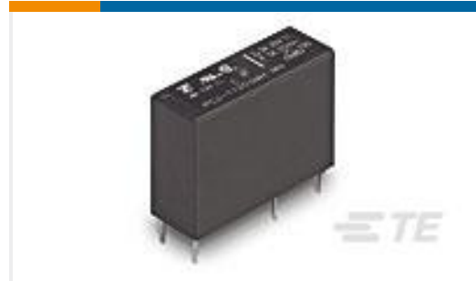
TE Part #1721531-4 PCJ-105D3MH,303