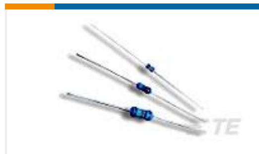
TE Part #1622790-1 LR2 1% 91K