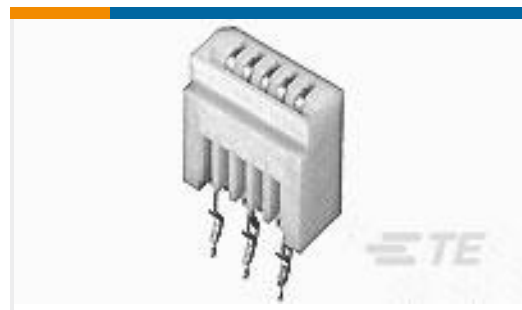
TE Part #1-84984-2 1mm FFC DIP V ASSY 12P TUBE