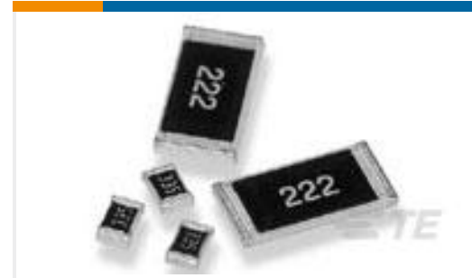
TE Part #3-2176185-1 CRGH0805 1% 330K 0.33W