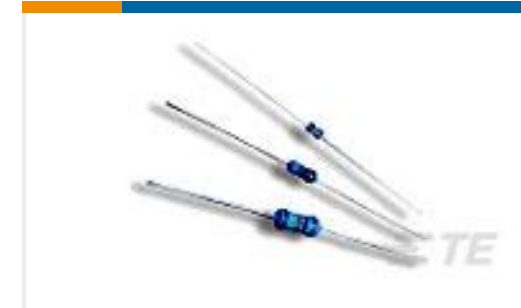
TE Part #1614996-1 LR0204 1% 13K