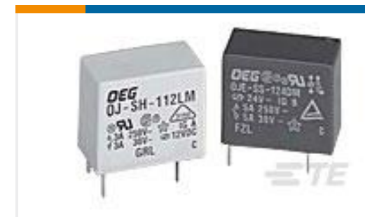
TE Part #1461403-3 OJE-SH-105LMH,000