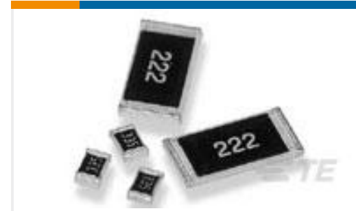
TE Part #9-1879512-2 CRGH0805 1% 47R 0.33W