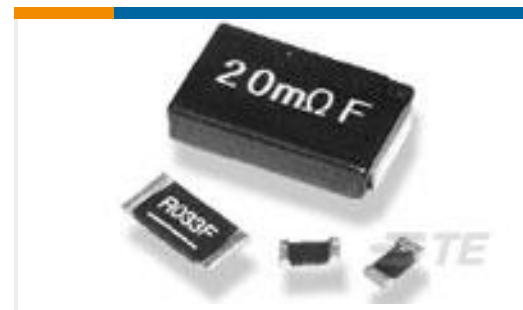
TE Part #3-1879378-1 TLR 2512 1.0W R0025 1% 150PPM 2K RL