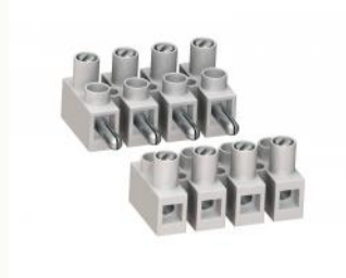
302-ST5 & 302-STB